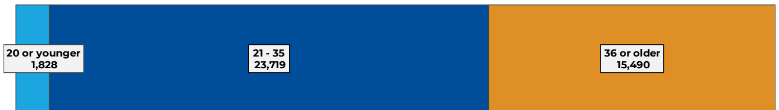
Age Breakdown of Total SoonerPlan Enrollment

Race is self-reported by members at the time of enrollment. The Two or More Race members have selected two or more races. Hispanic or Latino is an ethnicity not a race. Hispanics or Latinos can be of any race and are accounted for in a race category above.